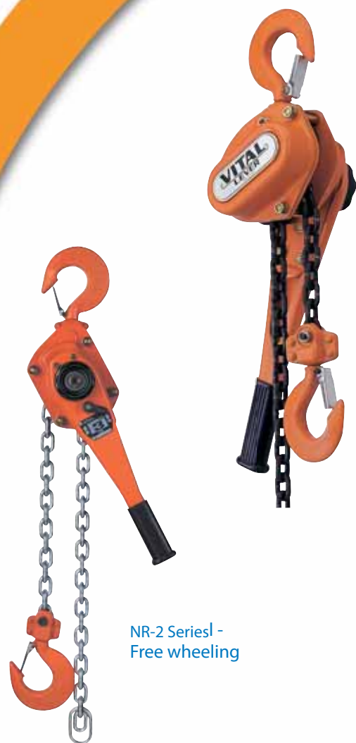
NR-2 SeriesI - Free wheeling

Vital Lever Blocks can now be fitted with overload protection.