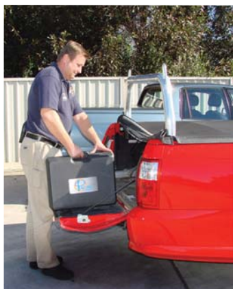
Transportant between sites