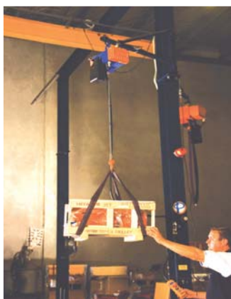
For lifting and positioning loads