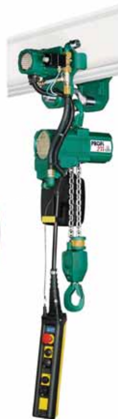
PROFi 6Ti SHOWN WITH OPTIONAL F1 CONTROL